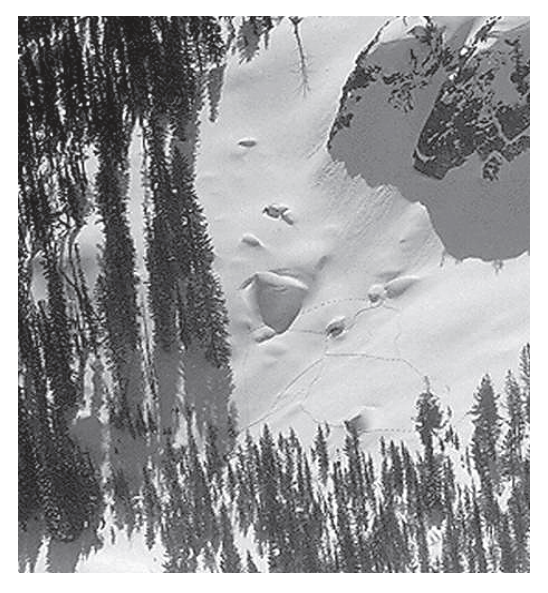
Figure 1. Wolverine dens tend to be at higher elevations and always in deep snows.

Phase II of the project will focus on understanding the spatial and temporal interactions between wolverine and recreation within these regions of overlap.