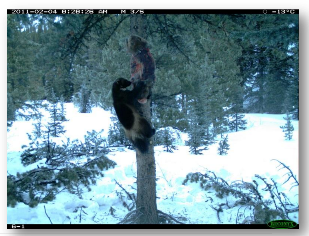
7 | Page

models that will predict where predators do and do not occur in relation to natural mountain heterogeneity and landscape development.