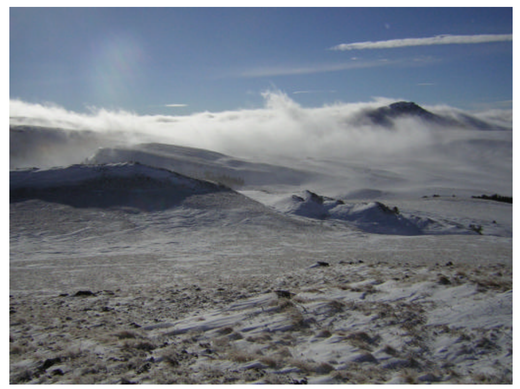
Winter on top of the Gravelly Range, Montana.

121 Trail Creek • Ennis, MT 59729 binman@wcs.org • kinman@wcs.org • tmccue@wcs.org • mpackila@wcs.org