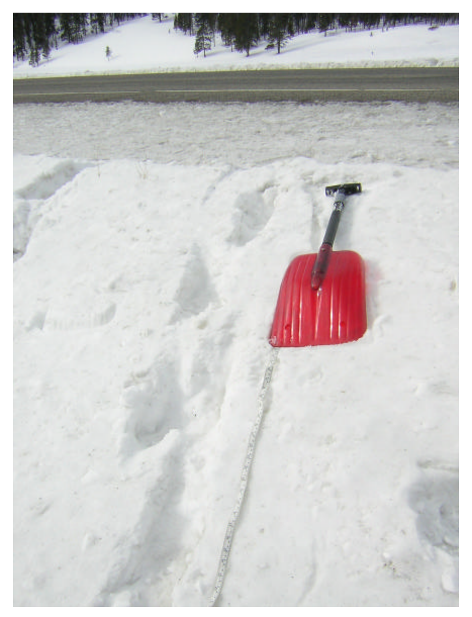
F133's tracks crossing US191 near Snowslide Creek in YNP.

The kit we captured last spring, F133, is currently dispersing. F133 spent the majority of last summer in the north end of the Gallatin Range. Beginning in the fall, she starting spending more time in the southern portion of the Gallatin. In late February she began showing signs that she might disperse with a move to the southern tip of the Gallatin Range. Her first move outside the Gallatin was to the Madison Range across US Highway 191 in Yellowstone National Park (YNP). We were able to document the location where she crossed back into the Gallatin Range a few days later. After a short stay in the southern Gallatin, her next location was in the Thorofare Creek area southeast of YNP. We will attempt to monitor her throughout her dispersal.