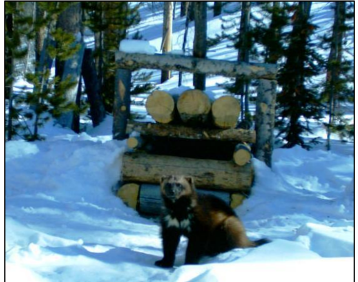
A wolverine at one of our 2011 pre-baited log-style traps on the Sawtooth National Forest. The lid is locked open, so he was free to come and go as he pleased last winter. He was certainly surprised this winter when the lid closed. He is now wearing a GPS collar for 3 months as one of our Stanley study area animals.

For the project to be able to understand the potential responses of wolverines to recreation, we need to look at a minimum of three landscapes with different and diverse recreation use patterns to monitor wolverines under a variety of conditions. Therefore, the work in our new study areas on the Sawtooth and Boise National Forests are as important as our initial work on the Payette National Forest has been.