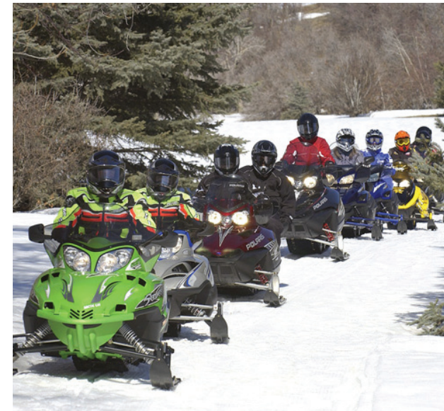
NYSSA thanks the thousands of landowners who allow use of their property.

Landowner generosity is the foundation of the statewide system that provides over $850 million annually to the state and local economy.